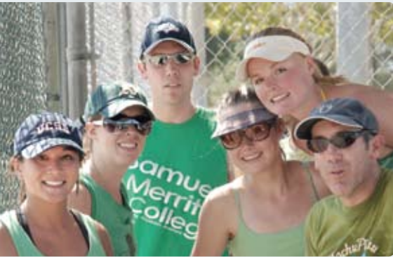
SMU students braved 104 degree temperatures to compete in a friendly softball tournament.