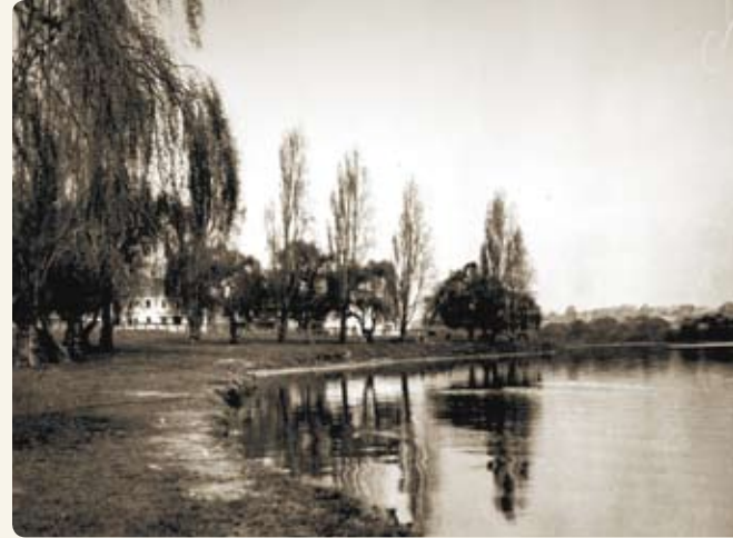
Lake Merritt, west shore, 1915.