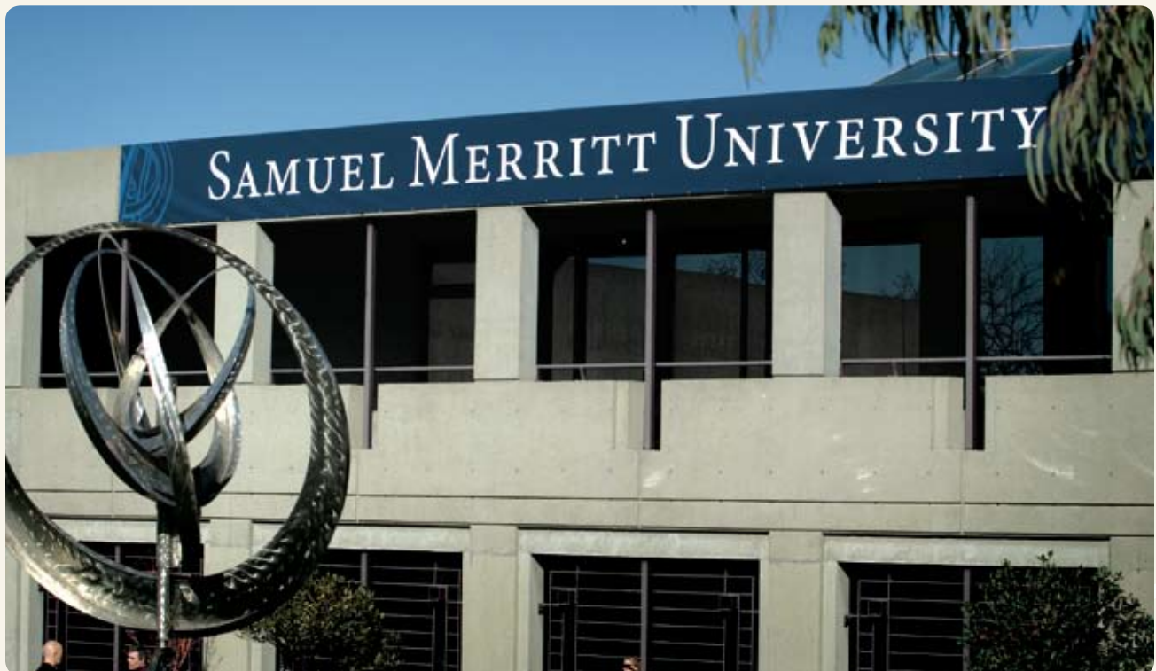
A banner bearing the new Samuel Merritt University name hangs on the Health Education Center.