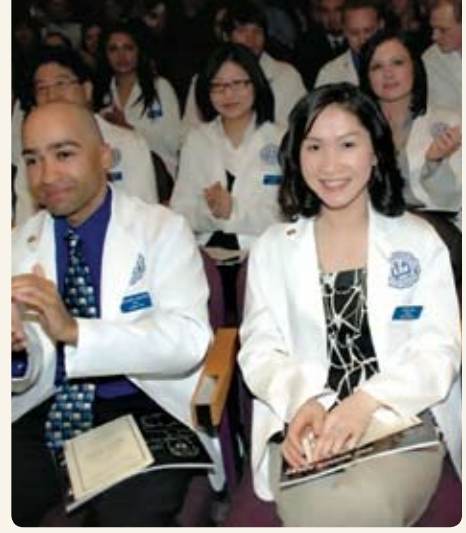
CSPM class of 2012 students at the 13th annual White Coat Ceremony.