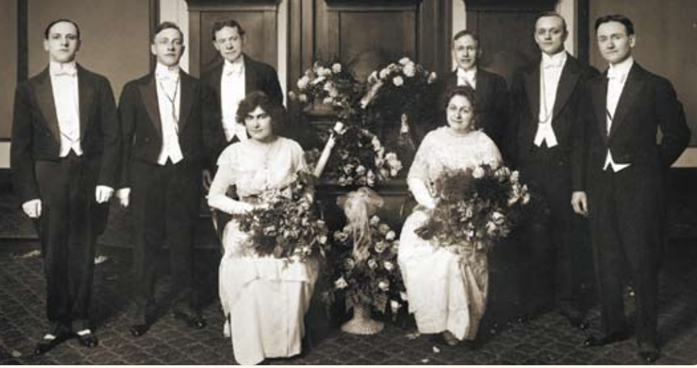
The first graduating class (1915) of the College of Chiropody.