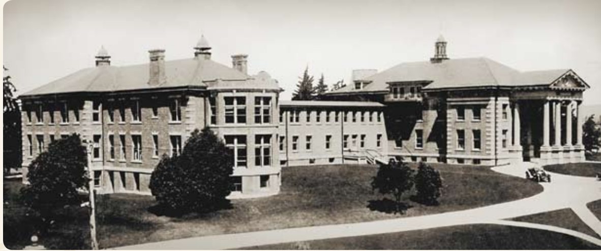
Samuel Merritt Hospital, 1909.